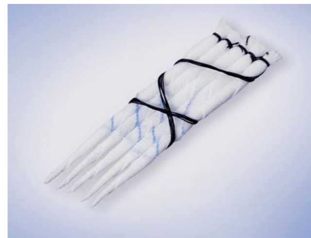
Neuromullsan® with x-ray markings, double-sterile pouch.